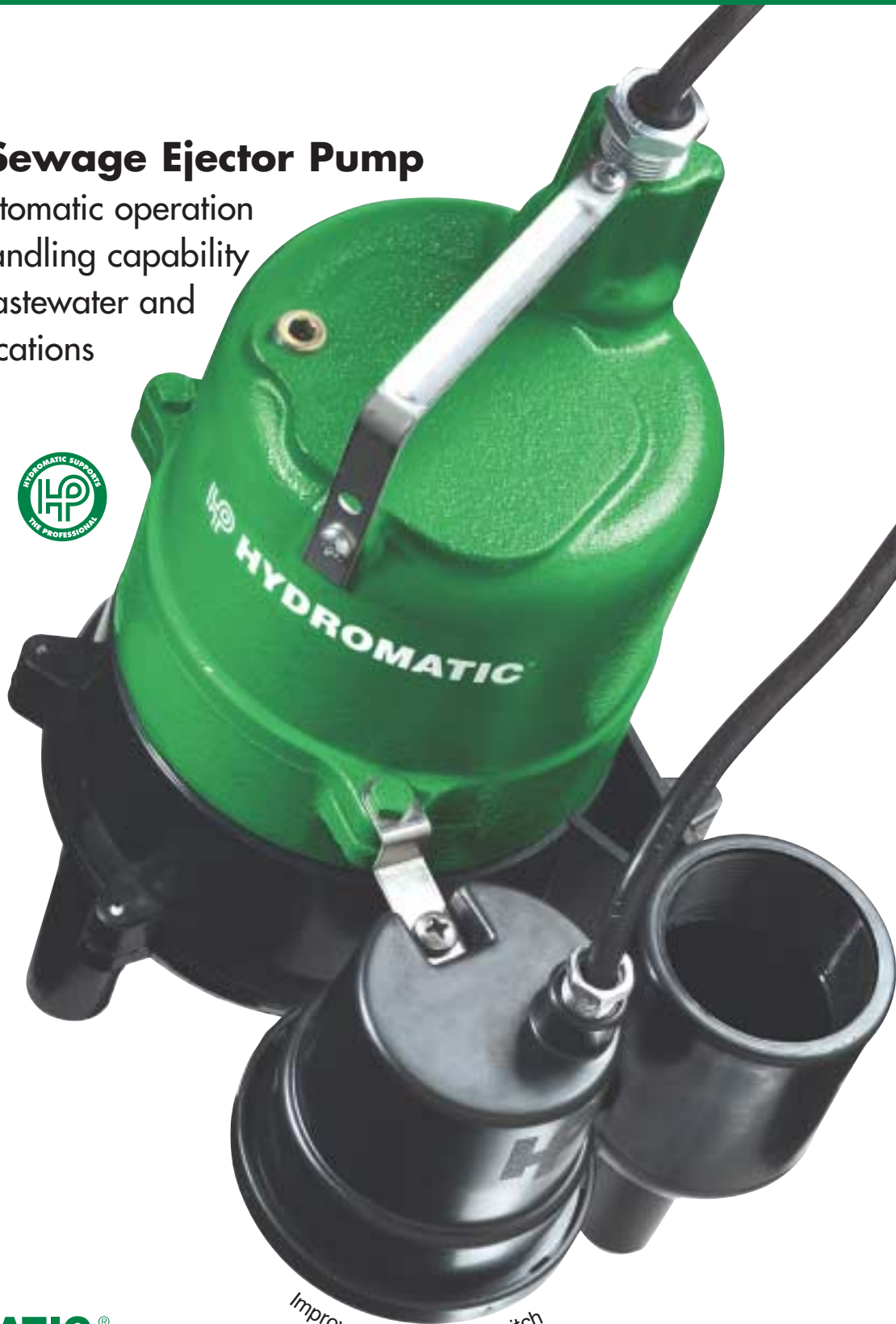
Improved Diaphragm Switch