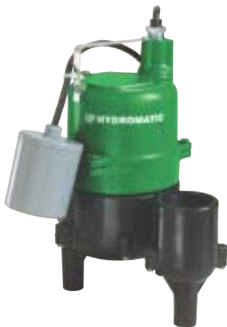
Wide angle float operation available